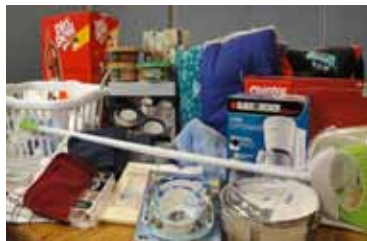
Welcome Basket for New Families

Contact the staff at 253-862-6808 or info@exodushousing.org .